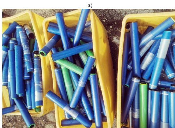
b) Figure 4. Plastic and metal sleeves - reuse (Alendarević, 2022; Krivokuća, 2022)

Cardboard sleeves on which polyamide fibers are wound have represented a problem for disposal for a long time. Although they have the character of non-hazardous waste, they are difficult to cut, soften and shred, i.e. they are prepared for recycling due to their high hardness and glue in them, Figure 5a and 5b.