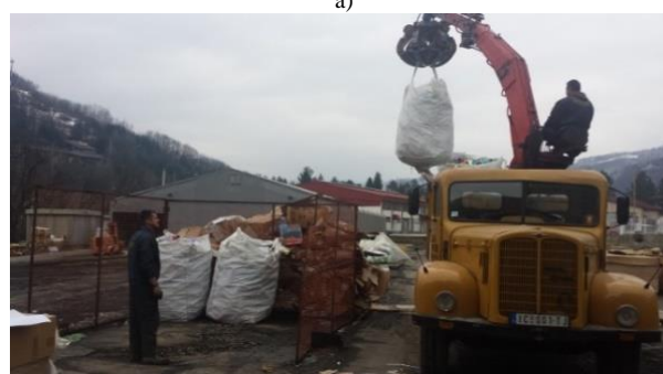
Figure 9. Collection of waste cardboard and cardboard sleeves (Alendarević, 2022; Krivokuća, 2022)