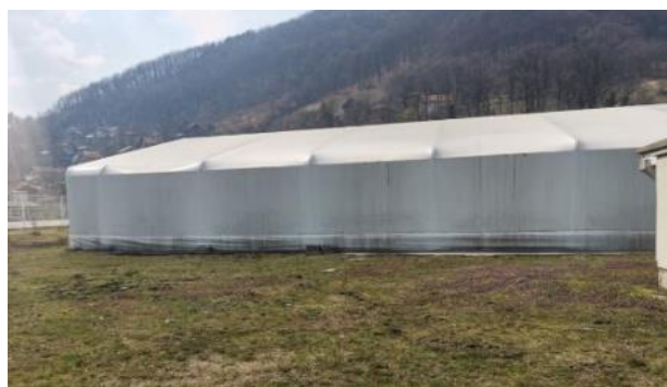
c) Figure 3. (a-c) Disposal of old paper and cardboard waste (Alendarević, 2022; Krivokuća, 2022)

All plastic and metal sleeves (yarn carriers) on which the polyamide fiber is delivered are returned to the supplier - as returnable packaging, which reduces the amount of generated industrial waste, Figure 4a and 4b.