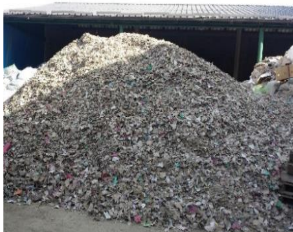
Figure 6. Shredded cardboard boxes, ready for baling (Alendarević, 2022; Krivokuća, 2022)

After handing over to an authorized local non-hazardous waste collector/storer, with whom a contract must be signed, the cardboard boxes are shredded by mechanical treatment (Figure 6), ground and baled in a waste warehouse with valid permits for mechanical treatment, and then handed over to a larger legal entity that collects them along with waste cardboard for recycling (Packaging Law 36/2009, 95/2018).