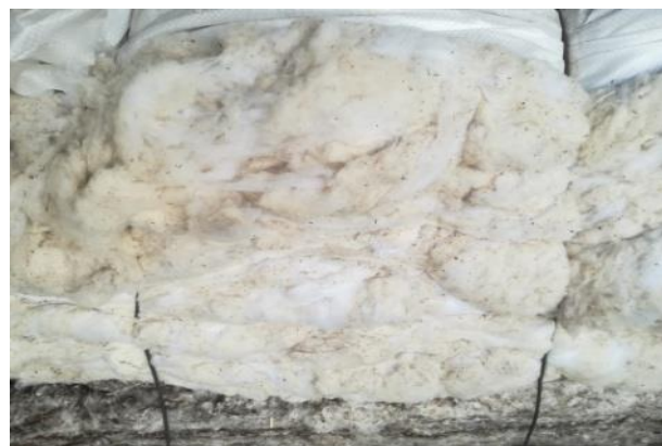
a) „bater“ and „strips“

Undyed textile waste originates from the working unit of knitting - whole scrap products, threads (fibers) of yarn left behind during knitting in machines and on spools (sleeves) - knitting phase; and whole scrap products, parts of products that fall off during cutting and sewing - finishing stage (assembly). One part that is discarded during the finishing work is the textile remains, the so-called "noodles" - it has a further use value, for example, in agriculture, for tying young fruit shoots, Figure 12.