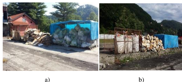
Figure 8. Formed mini eco – island: a) for the disposal of recyclable paper/cardboard sleeves and b) soft plastic (foil) within the factory (Alendarević, 2022; Krivokuća, 2022)