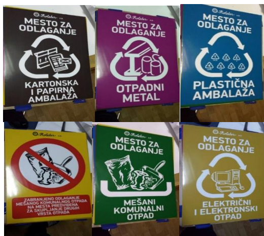
Figure 2. Marking of waste collection locations (Alendarević, 2022; Krivokuća, 2022)

Places for the disposal of certain waste are marked with signs on which there are inscriptions about the name of the waste. Figure 2 shows an example of marking the storage area in a textile manufacturing plant. Signs for waste marking are placed at locations intended for proper and orderly storage of waste within the company.