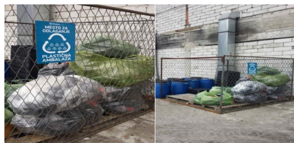
Figure 7. Hard recyclable plastic disposal site (Alendarević, 2022; Krivokuća, 2022)

emptying in the process of preparing the dyeing solution. Washed packaging has the character of non-hazardous waste. All plastic waste is temporarily stored on pallets on a concrete platform within the factory circle, marked and fenced, Figures 7-11.