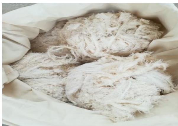
c) SULZER edges