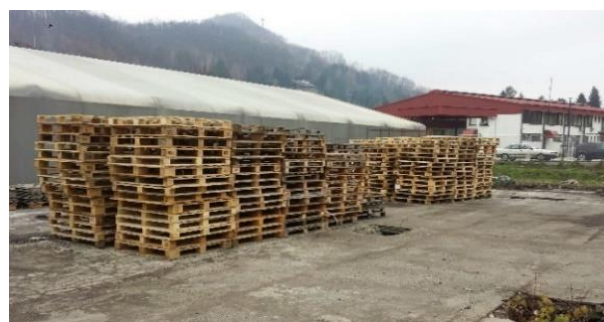
Figure 11. Wooden packaging – pallets that are returned to the supplier (Krivokuća, 2022, Alendarević, 2022)

In order to reduce the amount of waste generated, the following measures are taken: