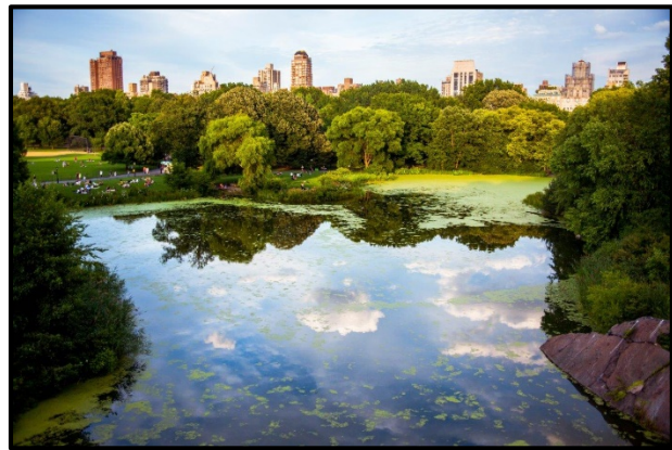
Figure 3. Blue-Green City (Blue Green City, 2024)

We expect this approach to directly influence the inhabitants' quality of life and public health. Despite the many advantages, green and blue infrastructure can potentially have unforeseen and unpleasant health-related consequences (Löhmus and Balbus, 2015). Stormwater retention ponds contribute to blue-green infrastructure by enhancing flood resilience, improving water quality, creating wildlife habitats, and increasing amenity and biodiversity values (Krivtsov et al., 2020). Ponds improve water quality by acting as natural filters, reducing contamination risk. They regulate stormwater runoff by storing excess water during heavy rainfall, reducing flooding and erosion, support biodiversity by providing habitats for diverse plant and animal species, enhance aesthetic appeal of green spaces, providing opportunities for recreation and wildlife observation, aid in climate adaptation by mitigating impacts of extreme weather events, cooling urban environments and Integration of ponds into blue-green infrastructure planning can create sustainable urban landscapes benefiting both the environment and public health (Löhmus and Balbus, 2015). Figure 3 illustrates the blue-green city concept and highlights how ponds are integrated into multifunctional urban blue-green infrastructure.