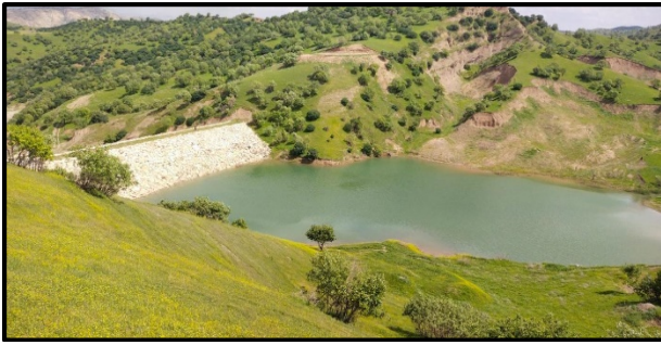
Figure 1. Darmeer Pond