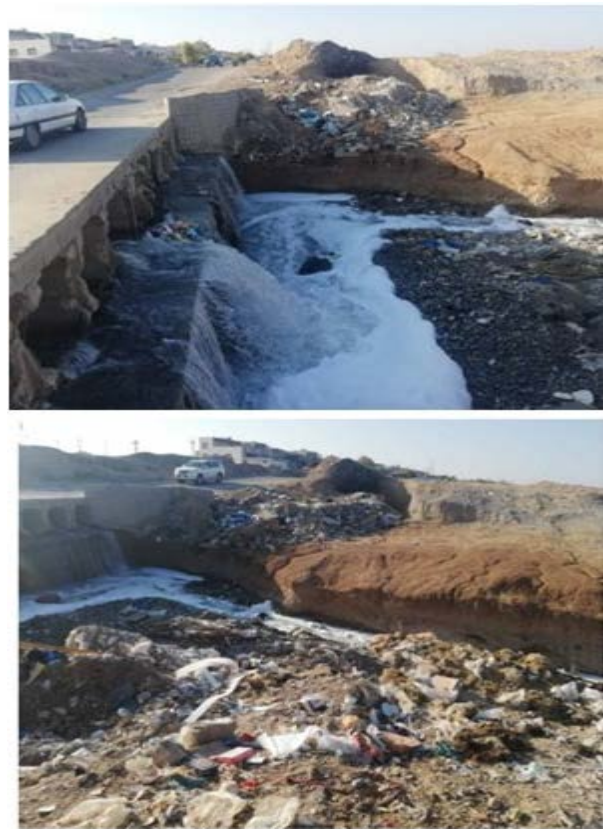
Figure 3. Roshanbiry Quarter wastewater

The wastewater from this site in Erbil city located near to 120 m-main road. As shown in Figure 3, the wastewater, which mainly comes from households or families, has been discharged into the natural