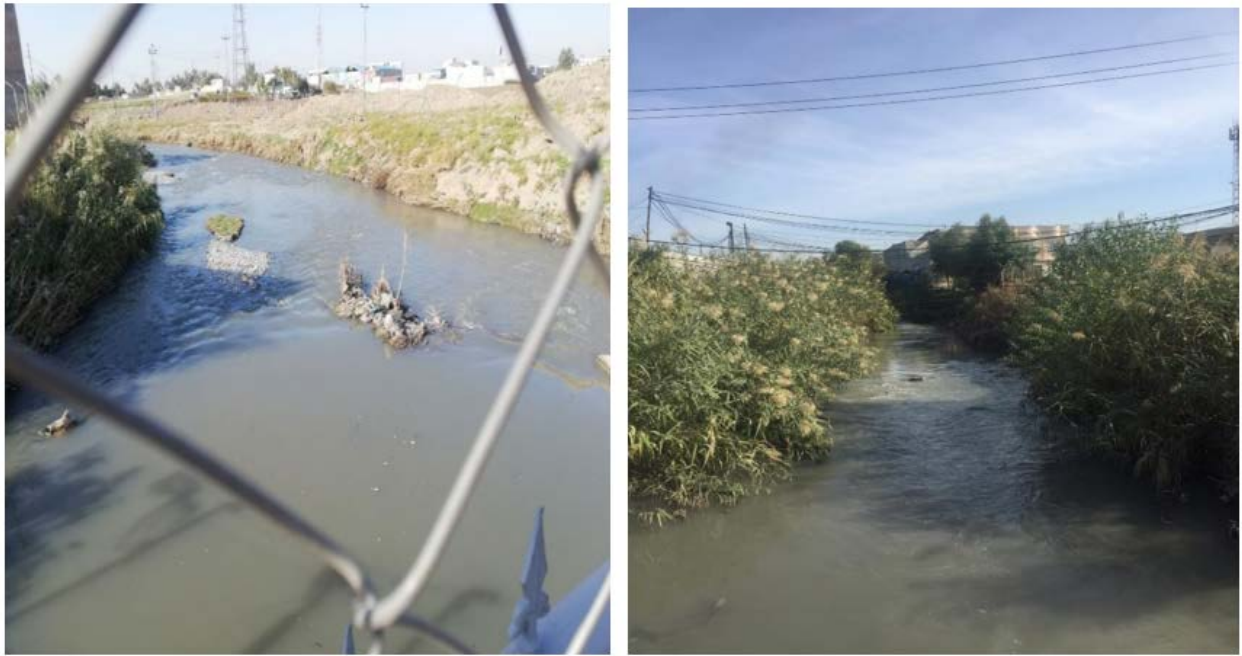
Figure 7. Erbil wastewater at Turaq area