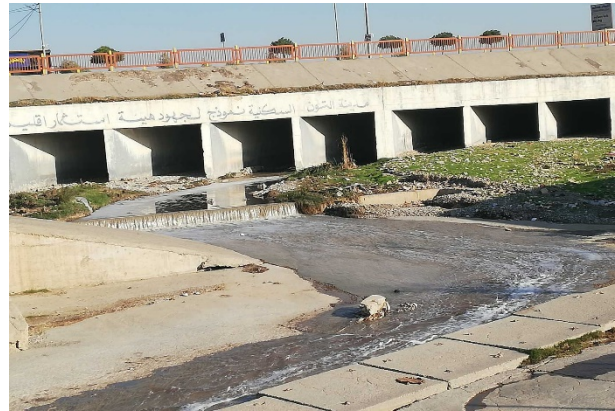
Figure 6. Total wastewater inside the Altun City

to a trapezoidal channel at the city itself. This system is old fashion collection of sewages of households that cause many problems since the sewages goes through the city, Figure 6.