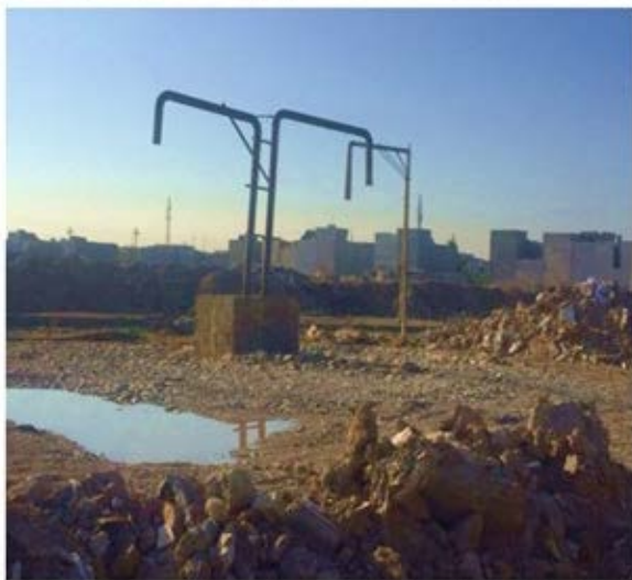
Figure 4. Wastewater near from Farmanbaran street