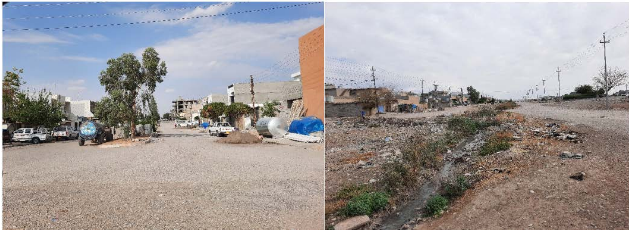
Figure 9. Wastewater conveying by sewerage system and unlined channel

are available in different lengths. Black wastewater is normally treated in cesspools. About 2 % of black wastewater is illegally connected to the sewerage system.