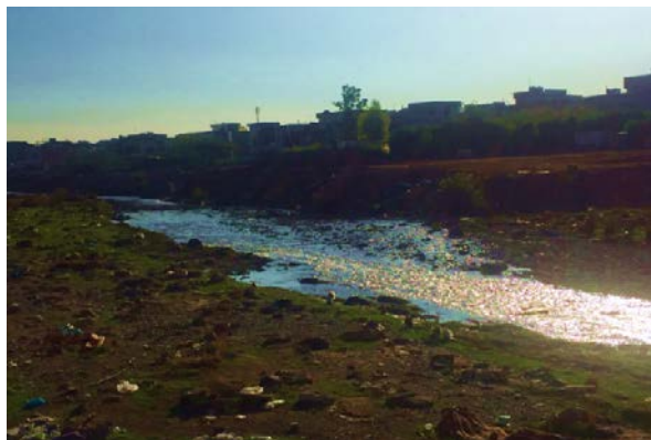
Figure 5. Wastewater near Zaituna street