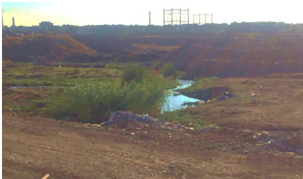
Figure 2. Wastewater from Shewasor watershed on Kornish road

The Shewasor Watershed is located at the east of Erbil City Center, on the right side of the 120-meter main road along Kornish Road. The wastewater in this location is collected behind a designated green space, as illustrated in Figure 2. Some of this effluent contributes to surface water pollution when it flows off the ground. However, remaining wastewater seeps into the soil layers underneath, which could seriously contaminate the nearby groundwater. The region's ecosystem is seriously threatened by these two effects: groundwater contamination and surface water pollution.