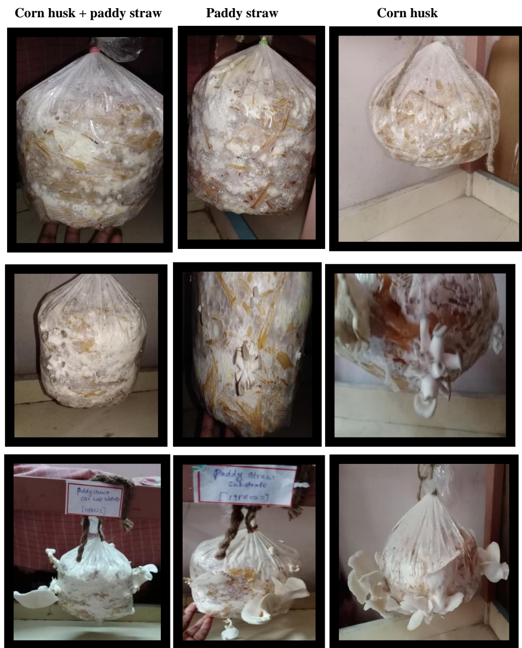
Plate: 2. Elm oyster's mushroom ( Hypsizygus ulmarius ) spawn running process and basidiocarp formation stage