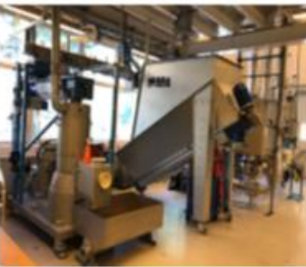
Small industrial pellet mill