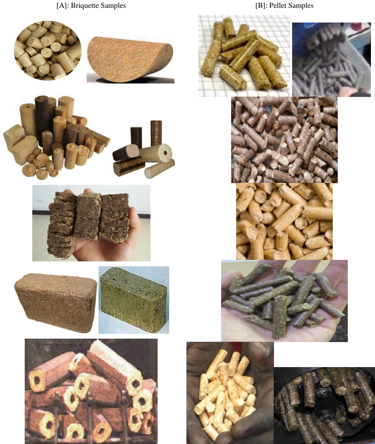
Figure 1. Densified biomasses for green energy production: ([a]. Briquettes; [b]. Pellets) (Bajwa et al., 2018; Hao, 2020; Coad, 2021; Madsen, 2021; Naehrig, 2021; Pesiakias, 2021; Smaliukas, 2021; Šooš, 2021; Ohlson, 2022)

produced from rape straw, to € 137.87 (US$ 149.36) per tonne for briquettes produced from a 50:50 mixture of rape straw and rapeseed oilcake (Stolarski et al., 2013). In Argentina, the costs of pellet production from sawmill residues were estimated at € 35-47 (US$ 37.92-50.92) per tonne (Uasuf and Becker, 2011).