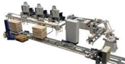
Automated packer and palletizer