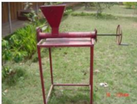
Manual briquetting device