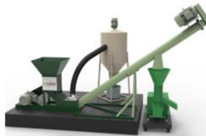
Continuous pellet production unit