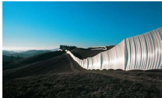
Figure 2. Running fence ( https://christojeanneclaude.net/artworks/running-fence/ )

A very famous work is the installation of the Bulgarian artist Christo Javacheff called “Running fence” (Figure 2). The fence was set up in America, starting from Highway 101, all the way to the exit to the Pacific Ocean. It is 39.4 kilometers long and 5.5 meters high, and was made of a piece of nylon ( https://christojeanneclaude.net/artworks/running-fence/ ).