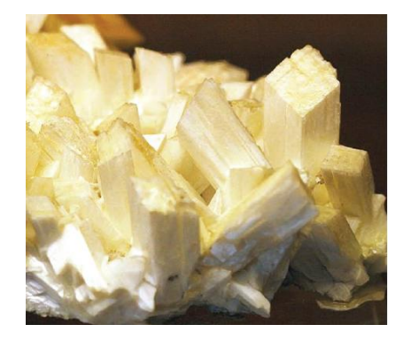
Figure 2. Natural Zeolite [9]

spaces, have determined the various properties of zeolites. The application of zeolites in various industries is dependent on their physical and chemical properties. Some of these properties include: density, size, shape, porosity, hardness, adsorption and cation exchange (Figure 2) [9, 10].